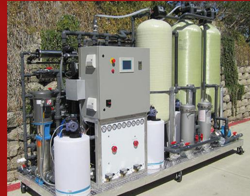
Bore Well Water RO Plant