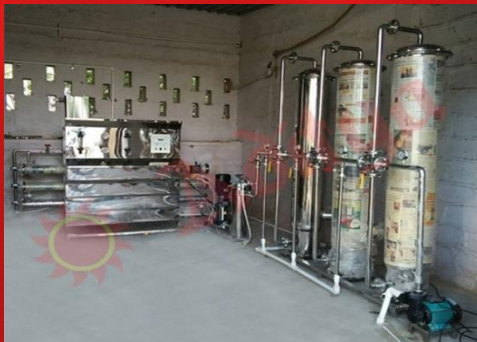
Commercial RO Plant