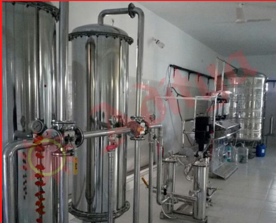
RO Water Treatment Plant