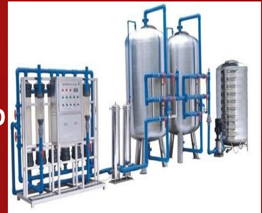
Water Filtration RO Plant