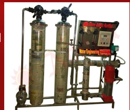
Commercial Water Treatment Plant