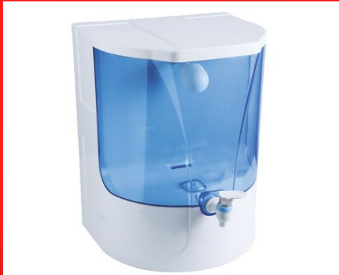
Domestic RO Plant