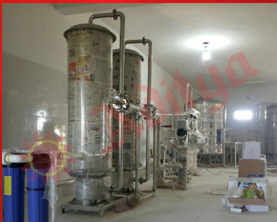
Industrial RO Plant